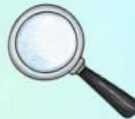
Going on a Scavenger Hunt