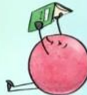
Reading Under a Tree