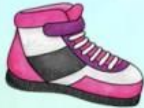
Taking a Walk